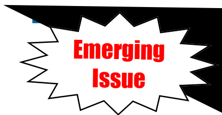
NC State Center for Health Statistics